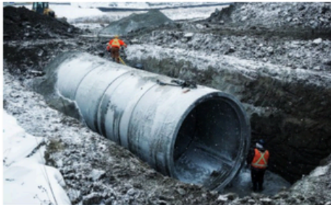
STORM & SANITARY