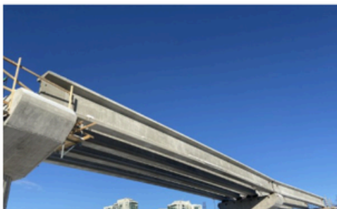
BRIDGES & GIRDERS