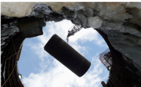
CONCRETE PRESSURE PIPE